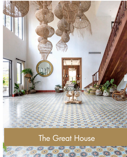
The Great House